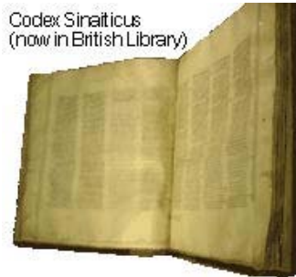
Codex Sinaiticus (now in British Library)

Aramaic – a Semitic language closely related to Hebrew that was the native language of Jesus and the language shared by most people in the eastern half of the ancient Roman Empire. The few Aramaic